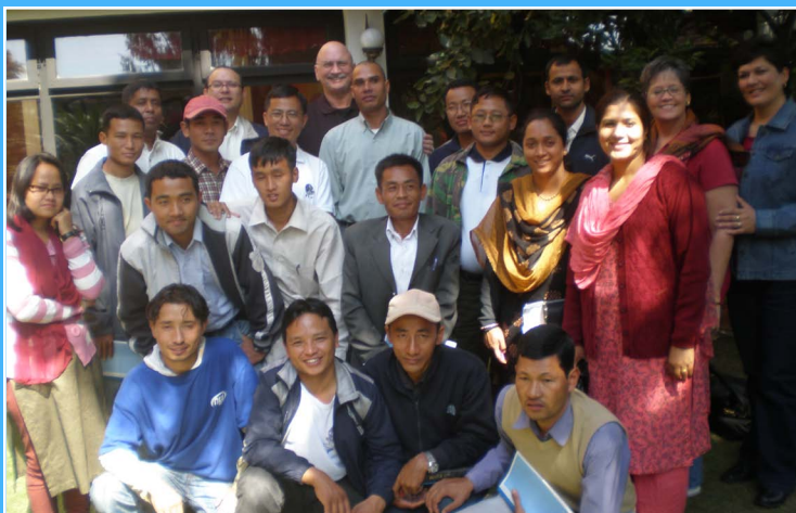
Above: From 22-25 October, 20 Nepali leaders gathered for the third Leadership Development Initiative (LDI) event held in South Asia and India. Other trainings were held for 35 leaders from the East and West Tamil Nadu Districts (15-18 October), and five leaders from Pakistan (20-21 October).

Below: A Work & Witness team from the Church of the Nazarene in White Stone, Virginia, U.S., partners with church members in Nepal 6 to 21 November to continue constructing the Kathmandu Ministry Center in the country's capital. The center will be used for compassionate ministries, pastor's education and other ministries. The team resulted from the South Asia Partnership.