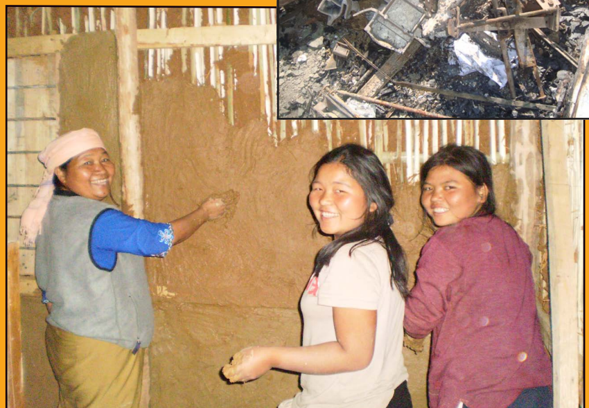
Top right: A block-making machine was among the equipment destroyed in the fire. Below: Volunteers mixed mud plaster to put up the temporary district center's new walls.