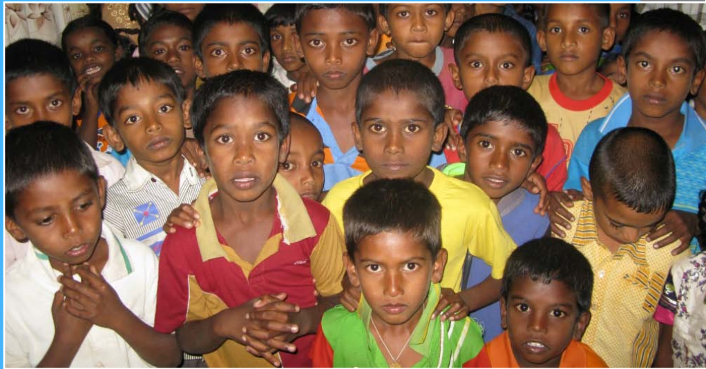
Right: Children pack into a newly-dedicated Child Development Center (CDC) in Sri Lanka.